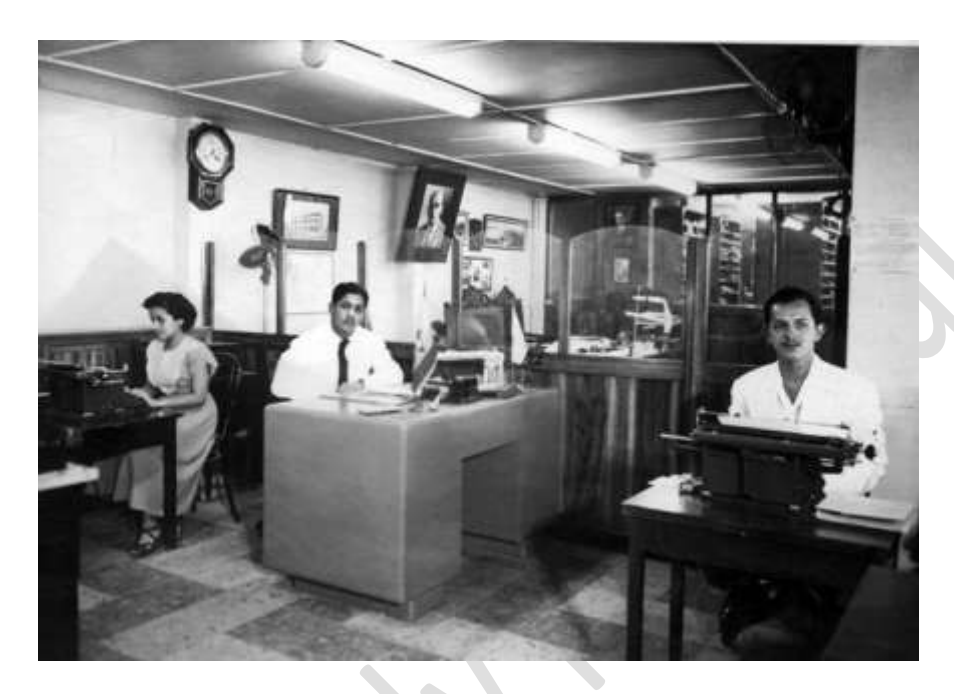
An office without computers

The current age referred as Information age, Digital age or New Media age has paved the way for great revolution in various spheres of business and industry. We cannot imagine our lives without information technology and computers.