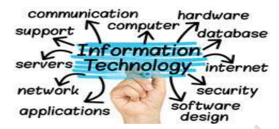
Fig 1: Various aspects of Information Technology

Before understanding relation of information technology with business, we should understand that it is made of two words Information and Technology.