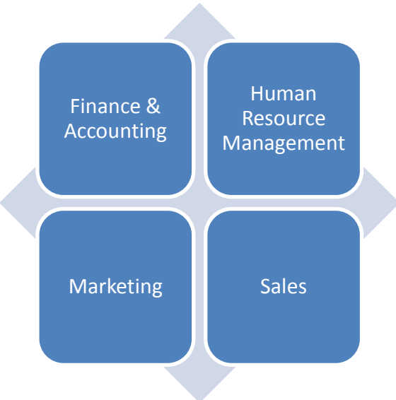
Figure 3: Usage of IT in different areas of business