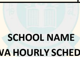
Annexure 4 -SEWA Hourly Schedule